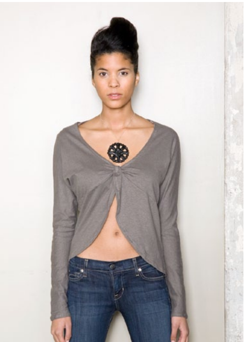
a Capella Cardigan