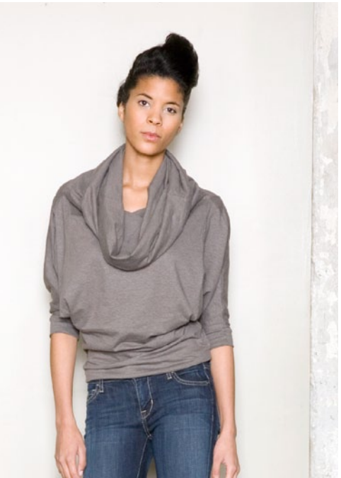
Treble Tunic (upside down)