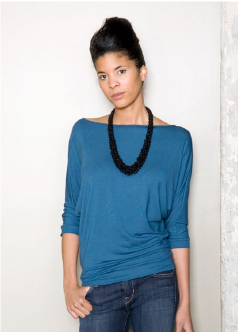
Kimono Sleeve Essential