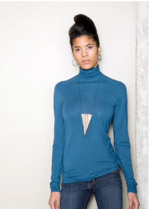
Raglan Turtleneck Essential